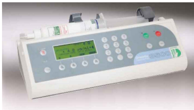
Fig. 3. Graseby Diprifusor ® TCI device loaded with a pre-filled propofol syringe.

The accuracy of TCI delivery for many intravenous anaesthetic drugs, including fentanyl, alfentanil, sufentanil, remifentanyl, propofol, etomidate, thiopental, midazolam, dexmedetomidine, and lidocaine has been demonstrated. 19 There are two mechanisms by which TCI devices can account for biologic variability. Firstly, TCI devices may incorporate patient covariates such as weight, height, age, sex, liver function, or cardiac output into the pharmacokinetic model. Secondly, the pharmacokinetic property of drug redistribution and accumulation in peripheral tissues is compensated for by adjusting the infusion rate. As a result of the pharmacokinetic modelling of tissue accumulation, setting a particular target propofol concentration on a TCI device typically results in achieving a predictable steady concentration in the patient. In contrast, manually setting a particular rate on a conventional infusion pump results in increasing drug concentrations over time as drug accumulates in peripheral tissues.