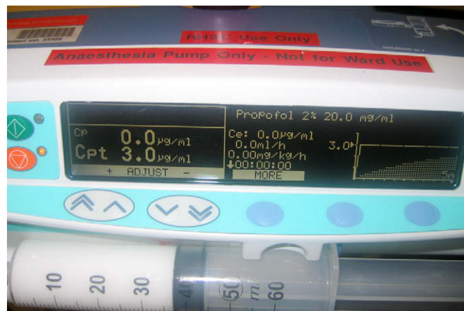
Fig. 4. Alaris PK syringe driver, loaded with generic propofol, with an indication of both C_p and C_e on the display: the solid line representing the predicted C_p and the dotted area representing C_e .

TCI systems can thus be used to increase or decrease the depth of anaesthesia, by altering infusion rates to achieve the chosen effect site concentrations. A natural extension of this capacity is to predict time to awakening from anaesthesia, which many TCI infusion devices also display. Accurate prediction of recovery prevents unnecessary administration of drug, improves safety by facilitating rapid return of protective airway reflexes and