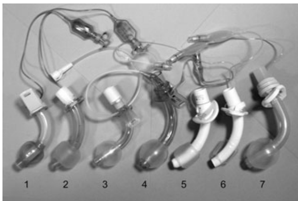
Figure 1 Various 8-mm internal diameter ‘standard length’ cuffed tracheostomy tubes: 1 Portex Blue line (Smiths Medical, Hythe, UK); 2 Portex Blue line ultra; 3 Mallinckrodt suction (Mallinckrodt Medical, Athlone, Ireland); 4 Mallinckrodt Perc; 5 Shiley (Mallinckrodt Medical, Athlone, Ireland); 6 Tracoe twist (Tracoe medical GmbH, Frankfurt, Germany), 7 Shiley tracheosoft XLT.