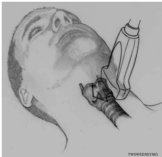
Fig. 1 Sonographic identification of landmarks in the sagittal plane.

During the first phase of the project, the necks of 4 cadaveric models were examined. A 10.5 MHz linear probe (38 mm) of a Sonosite Titan ultrasound machine (SonoSite, Inc, Bothell, WA) was used to obtain sonographic images on all cadaver models. Visual and palpable landmarks were compared with the sonographic images of the thyroid cartilage, tracheal rings, cricoid cartilage, CM, and other adjacent structures. Using this information, a protocol for ultrasound localization of the CM was created. Beginning in the sagittal plane, the thyroid